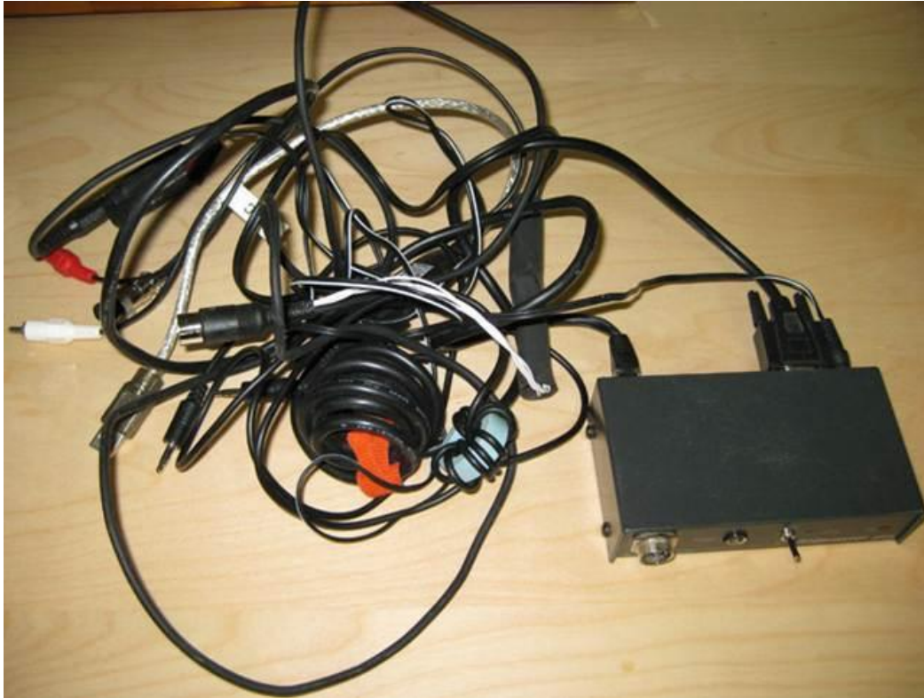
Figure 2, Typical Digital Mode Setup

On top of tweaking the cables and making them work, there is often additional effort to manage the sound card in the PC itself. Some operators use two sound cards or an external sound card because the one built into the PC itself is typically of lower quality. The PC software must be told that digital applications make sounds on one sound card while the PC makes sounds on another. If this is not done correctly, sounds from the PC can end up being transmitted over the air. You may have heard Windows beeps or startup sounds on the air before and wondered how this happens.